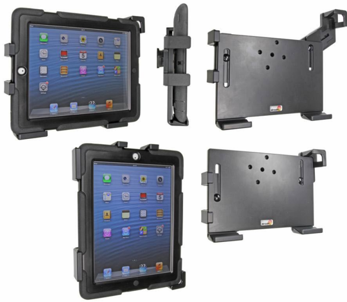
Sample device is shown