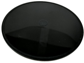
Sold Separately - See "Related Products" or Search for #100642